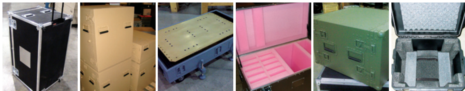
Custom Protective Foaming Services/Anti-Static ESD Protection